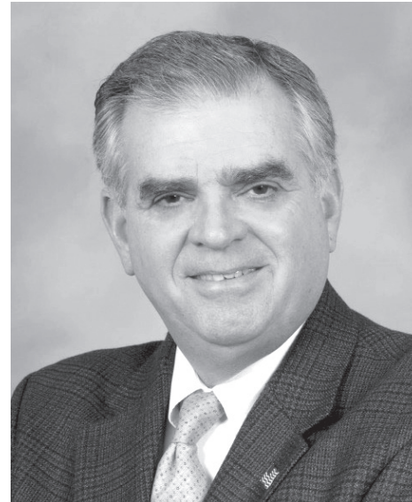
Ray LaHood, U.S. Transportation Secretary

Each of these remarkable accomplishments is a tribute your hard work, creativity, commitment to excellence, and most of all, your dedication to our country. DOT is fortunate to have such an extraordinary group of public servants. I look forward to continuing to work with all of you as the selection and